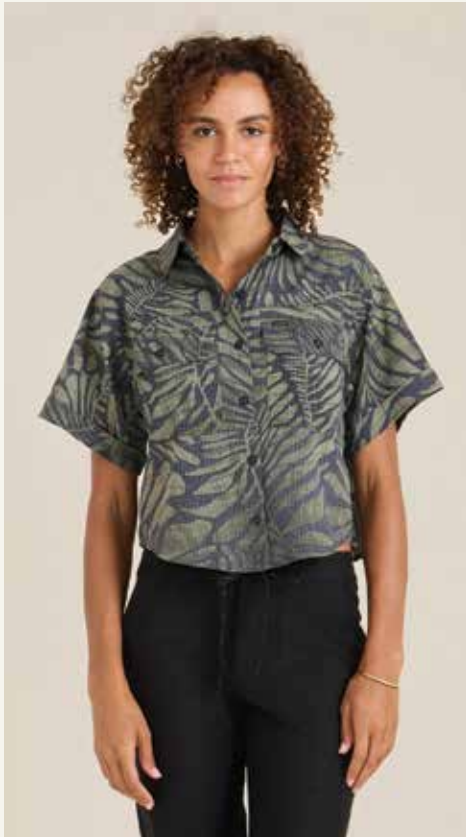
BLESS UP CROPPED WRW029-DKM AVAILABLE: 07-01-25 XS-XL

FABRIC: 68% Nylon, 32% Polyester NOTES: Cropped technically cool shirt, sleeve cuffs