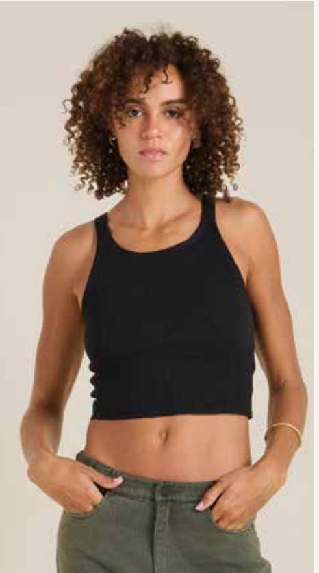
WIND WORN TANK WRK013-BLK AVAILABLE: 07-01-25 XS-XXL

FABRIC: 81% Recycled Polyester, 14% Cotton, 5% Spandex NOTES: Fitted racer tank with skinny straps in moisture wicking quick dry rib texture