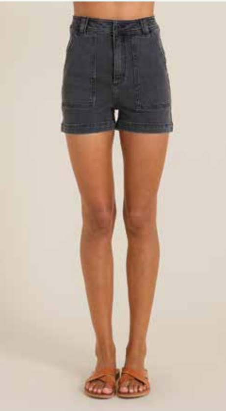
HWY SHORT WRS015-FDL AVAILABLE: 07-01-25 24-34

FABRIC: 99% Cotton, 1% Elastane NOTES: Mid-rise surplus style short with patch pockets & D-ring, 3" inseam