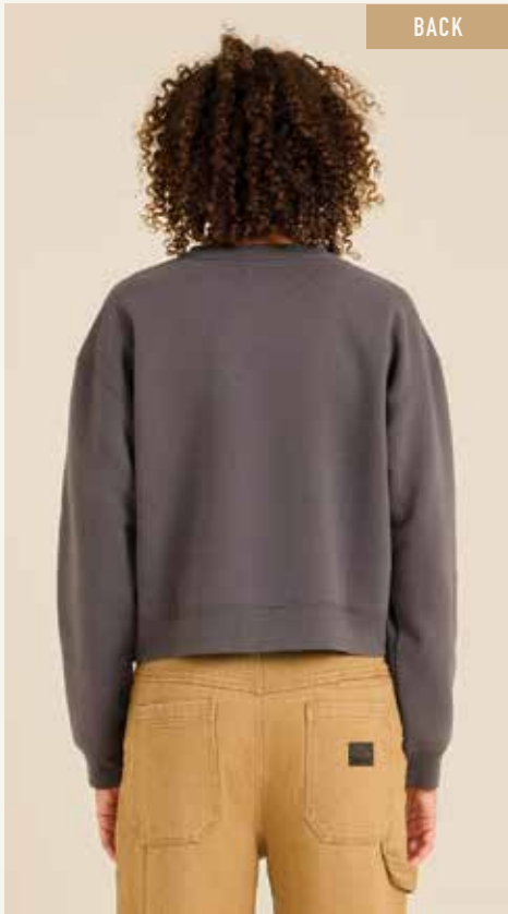
PORT WRF015-FDL AVAILABLE: 07-01-25 XS-XL

FABRIC: 53% Cotton, 47% Polyester NOTES: Boxy cropped relaxed fit crewneck fleece pullover, rib trim