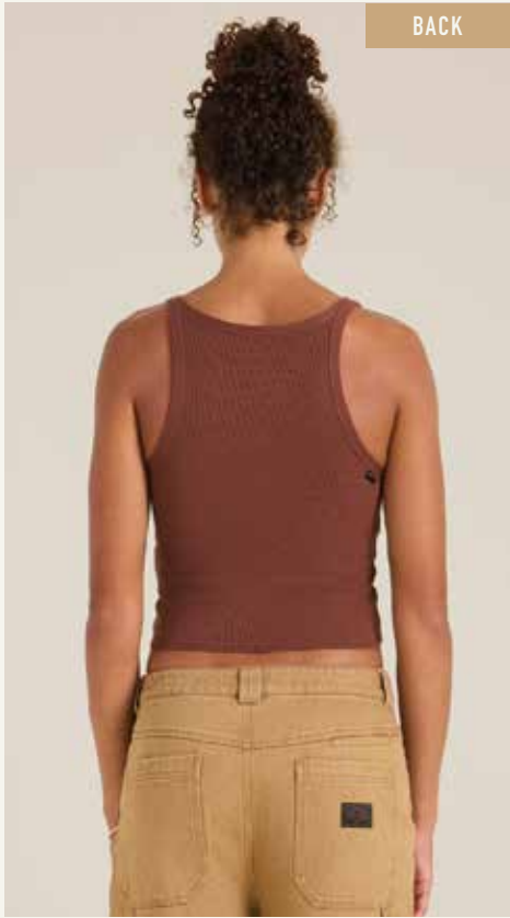
WIND WORN TANK WRK013-SEP AVAILABLE: 07-01-25 XS-XXL