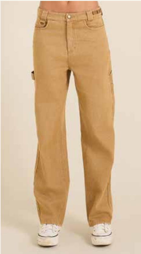
HWY 1 PANT WRD004-OTT AVAILABLE: 07-01-25 24-34

FABRIC: 70% Cotton, 30% Lyocell NOTES: Mid rise straight leg, flat front painters pant, with shank closure, zip fly, utility loop, pockets & D-ring