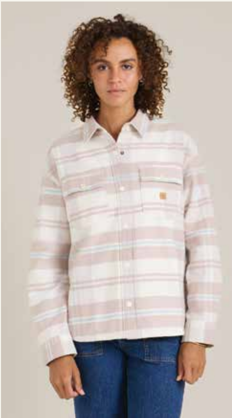
AMBERLEY WRW001-GLA AVAILABLE: 08-01-25 XS-XXL