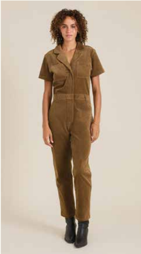
LAYOVER CORD JUMPSUIT WRU014-OTT AVAILABLE: 08-01-25 XS-XL

FABRIC: 99% Cotton 1% Elastane NOTES: Relaxed fit coverall, full zip entry