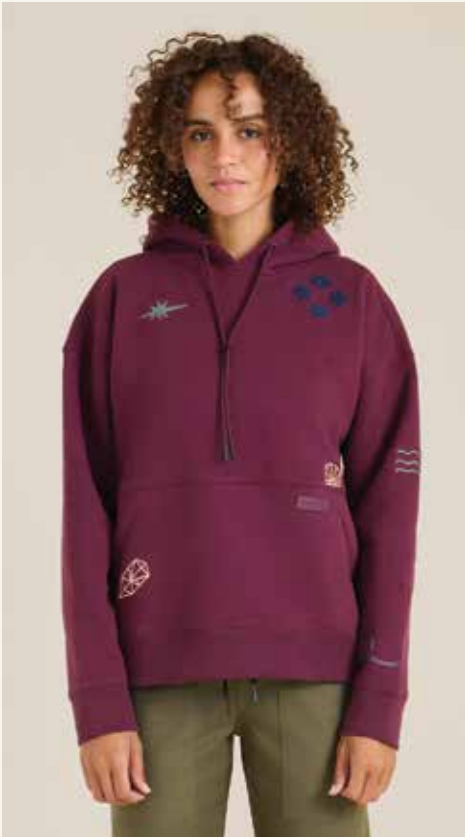
HIKER HOODIE WRF011-BBY AVAILABLE: 08-01-25 XS-XXL

FABRIC: 80% Cotton, 20% Polyeste NOTES: Oversized hoodie with split body seam, pockets with hidden zippers, drawcord stopper, embroidery art