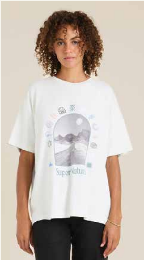
SUPER NATURAL OVERSIZED TEE WRT063-MST AVAILABLE: 07-01-25 XS-XL

FABRIC: 100% Cotton NOTES: Oversized crewneck