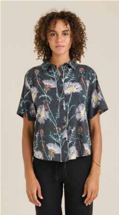
BLESS UP SS WRW021-ONX AVAILABLE: 07-01-25 XS-XXL

FABRIC: 68% Nylon, 32% Polyester NOTES: Oversized button front technically cool shirt