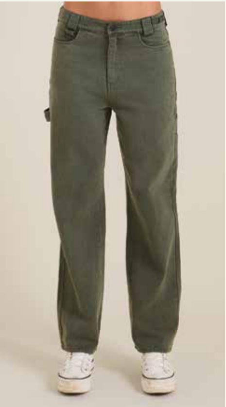
HWY 1 PANT WRD004-DKM AVAILABLE: 07-01-25 24-34

ABRIC: 70% Cotton, 30% Lyocell NOTES: Mid rise straight leg, flat front painters pant, with shank closure, zip fly, tility loop, pockets & D-ring