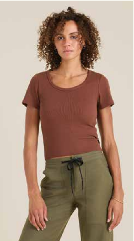
WIND WORN TEE WRK015-SEP AVAILABLE: 07-01-25 XS-XXL

FABRIC: 81% Recycled Polyester, 14% Cotton, 5% Spandex NOTES: Fitted cap sleeve tee shirt with scooped neckline in moisture-wicking quick dry rib texture