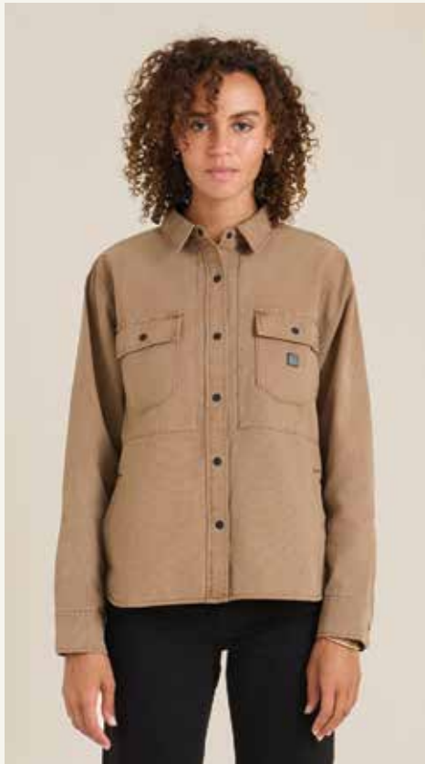
HEBRIDES UNLINED JACKET WRJ024-OTT AVAILABLE: 08-01-25 XS-XL

FABRIC: 100% Cotton NOTES: Relaxed fit shacket with snap closure, reinforced panels, longer length