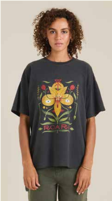
TOMAS WILDFLOWER OVERSIZED WRT062-BLK AVAILABLE: 07-01-25 XS-XL

FABRIC: 100% Cotton NOTES: Oversized crewneck