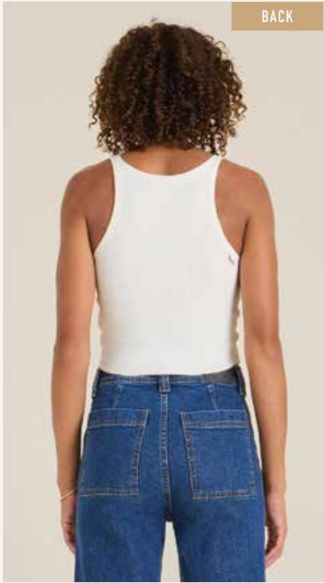
WIND WORN TANK WRK013-WWH AVAILABLE: 07-01-25 XS-XXL