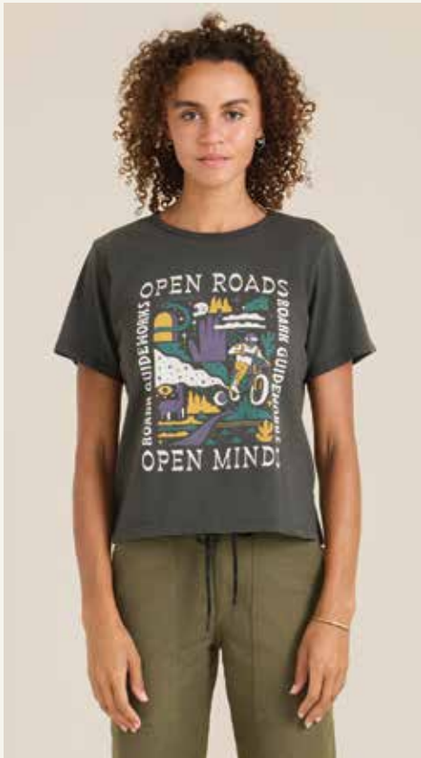
OPEN ROADS EVERYDAY TEE WRT066-DKM AVAILABLE: 07-01-25 XS-XL