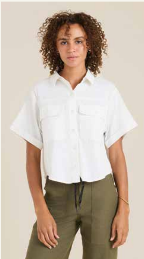
BLESS UP CROPPED WRW029-MST AVAILABLE: 07-01-25 XS-XL

FABRIC: 68% Nylon, 32% Polyester NOTES: Cropped technically cool shirt, sleeve cuffs