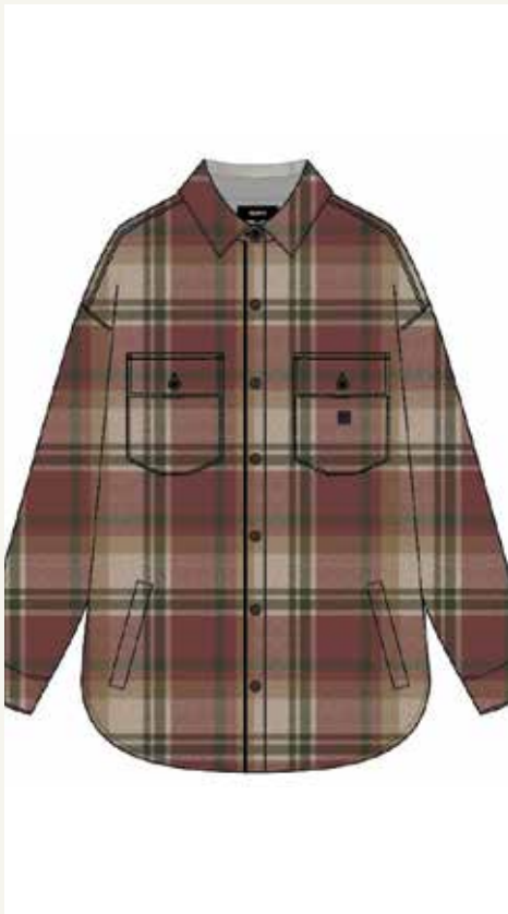
AMBERLEY WRW001-SNA AVAILABLE: 08-01-25 XS-XXL