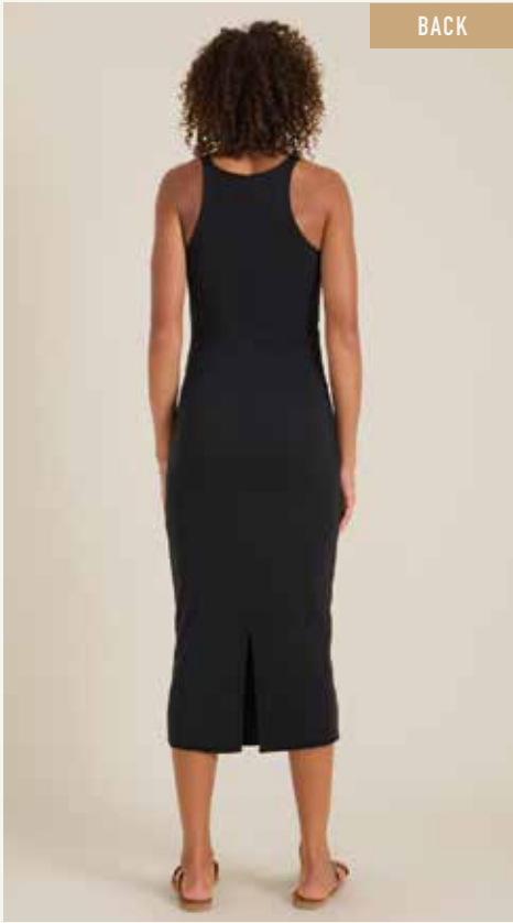
WIND WORN DRESS WRR008-BLK AVAILABLE: 07-01-25 XS-XXL