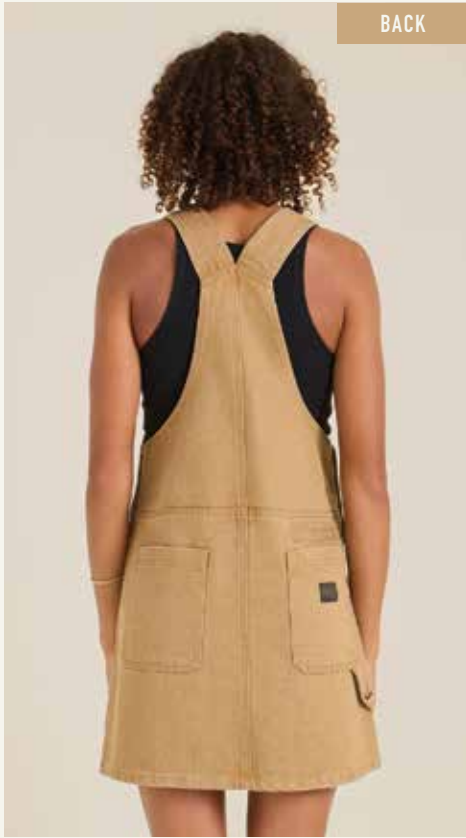
HWY 1 OVERALL DRESS WRR013-OTT AVAILABLE: 07-01-25 XS-XL

FABRIC: 70% Cotton, 30% Lyocell NOTES: Overall style relaxed fit dress with self straps