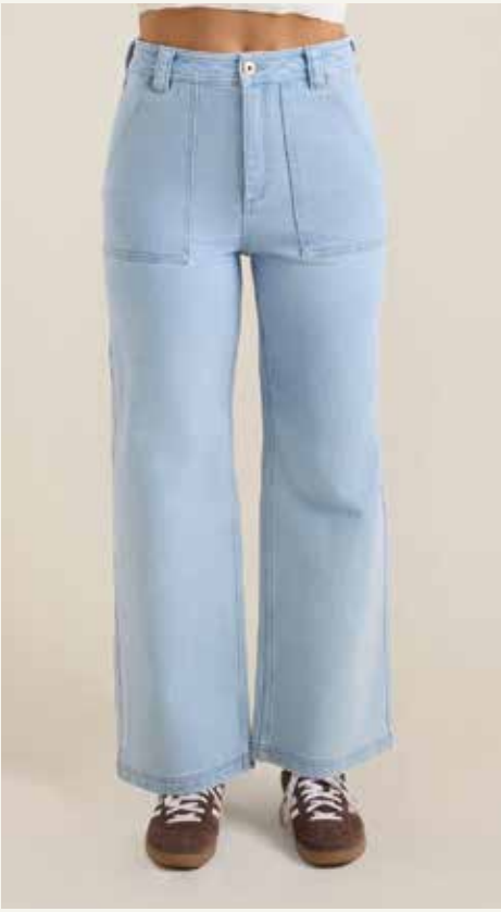
HWY SS125 PANT WRD003-LBI AVAILABLE: 07-01-25 24-32

FABRIC: 99% Cotton, 1% Elastane NOTES: High waisted sailor fit jean with utility patch pockets, wide leg, ankle crop length