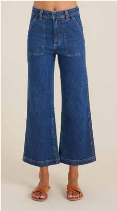
HWY SS125 PANT WRD003-IND AVAILABLE: 08-01-25 24-32

FABRIC: FABRIC: 53% Cotton, 47% Polyester NOTES: High waisted sailor fit jean with utility patch pockets, wide leg, ankle crop length