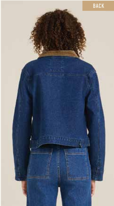
OPEN ROADS DENIM JACKET WRJ025-IND AVAILABLE: 08-01-25 XS-XL

FABRIC: 99% Cotton, 1% Elastane NOTES: Boxy shrunken fit denim trucker with 3x pockets and corduroy collar