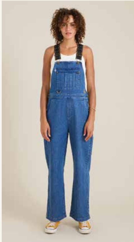
HWY 1 OVERALL WRU010-IND AVAILABLE: 08-01-25 XS-XL

FABRIC: 99% Cotton, 1% Elastane NOTES: Relaxed fit straight leg utility overall with elastic straps