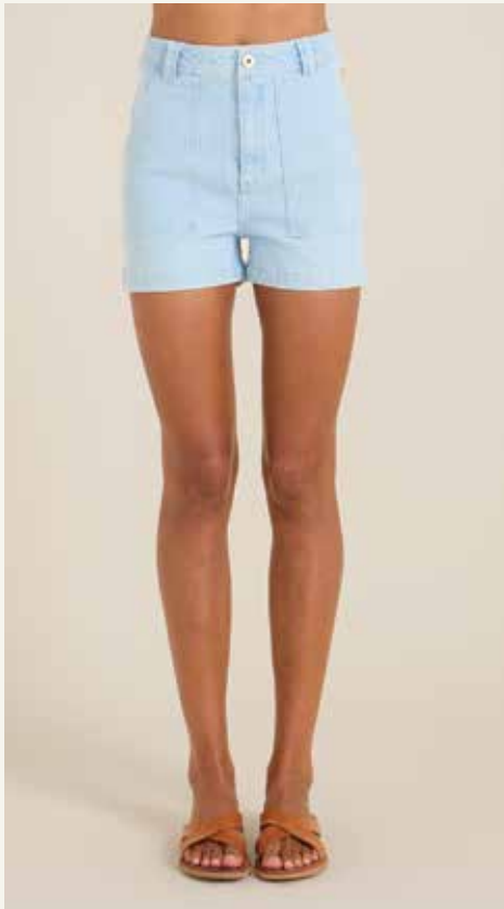
HWY SHORT WRS015-LBD AVAILABLE: 07-01-25 24-34

FABRIC: 99% Cotton, 1% Elastane NOTES: Mid-rise surplus style short with patch pockets & D-ring, 3" inseam