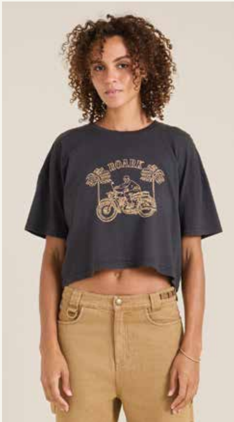
MOTO SKELE BOXY CROP WRT065-FDL AVAILABLE: 07-01-25 XS-XL