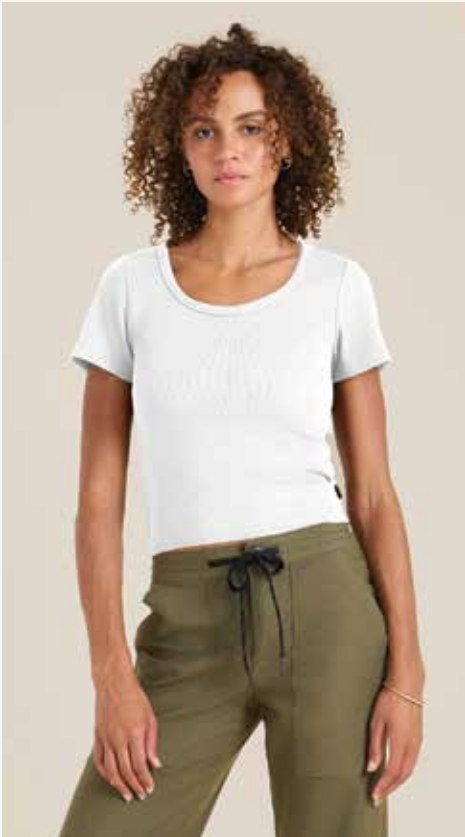
WIND WORN TEE WRK015-WWH AVAILABLE: 07-01-25 XS-XXL

FABRIC: 81% Recycled Polyester, 14% Cotton, 5% Spandex NOTES: Fitted cap sleeve tee shirt with scooped neckline in moisture-wicking quick dry rib texture