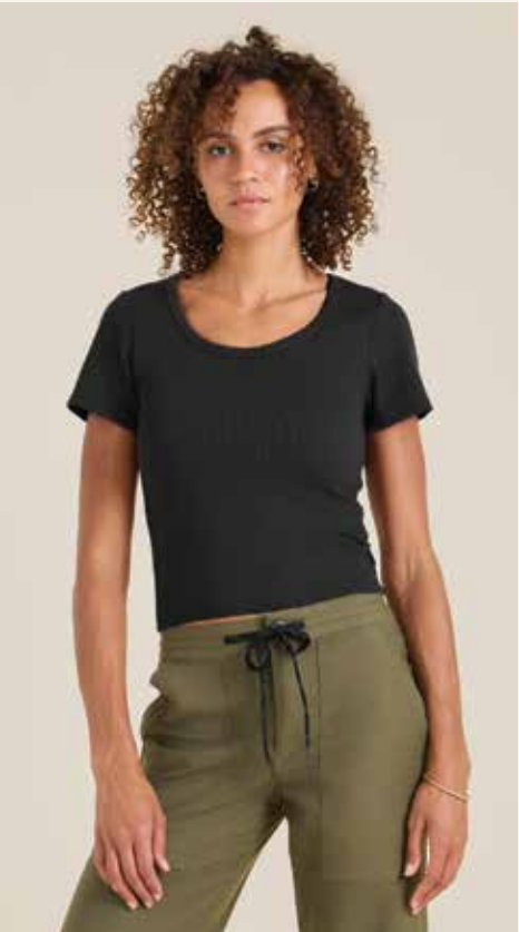
WIND WORN TEE WRK015-BLK AVAILABLE: 07-01-25 XS-XXL

FABRIC: 81% Recycled Polyester, 14% Cotton, 5% Spandex NOTES: Fitted cap sleeve tee shirt with scooped neckline in moisture-wicking quick dry rib texture